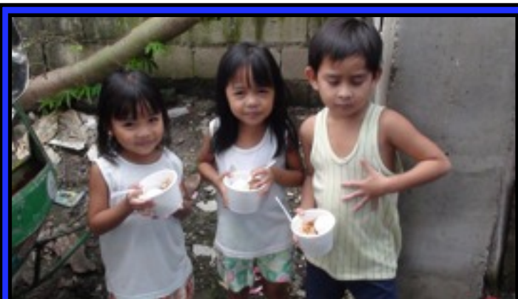
A few of the 120 thousand meals purchased in Manila, Philippines by World Compassion Network.

Through your donations to WCN we were able to purchase $5000 worth of medicines that will save many lives. We purchased food to feed over 120,000 poor Filipinos for the next crucial months. We also supplied eight churches with equipment to help sustain the feeding efforts of this disaster and in future disasters. Please visit our website, w-c-n.org , to see a video of our efforts in the Philippines. We give all praise and glory to God who is using each of us to show the love and grace of Jesus to the poor and suffering.