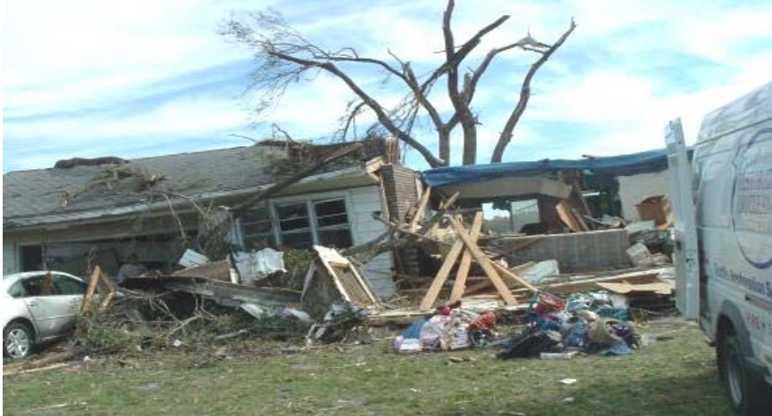
Reduced to trash in minutes