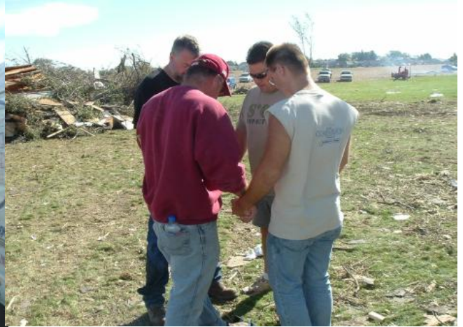
Our team prays with home own owner

On October 18th 2007 at 10:25 pm the lives of hundreds of people where changed for the foreseeable future in just a few minutes in Nappanee Indiana. A category 3 tornado struck this small northern Indiana town. Many residents were inside their home preparing for bed when the tornado touched down on the southwest side of town and cut a path of destruction for more than a mile moving northeast across then city. The miracle is that no one was killed and only a few were injured.